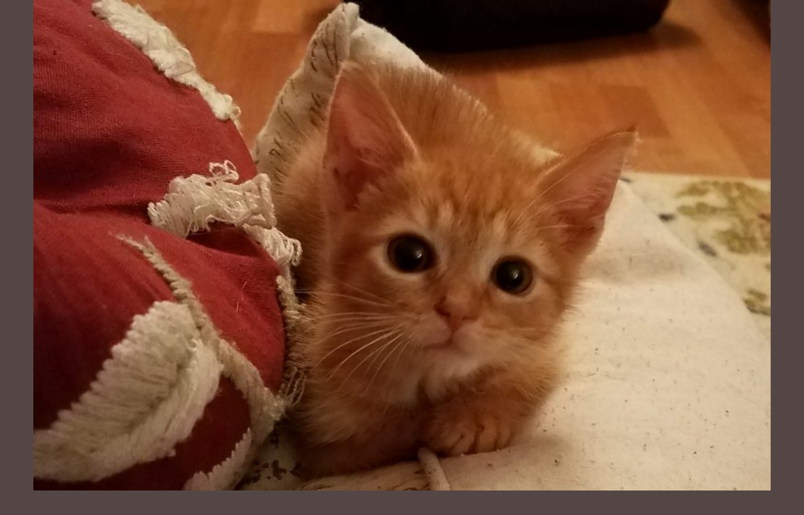
Copyright © 2017 C.A.R.E., All rights reserved.

Cat Adoption and Rescue Efforts, Inc. (C.A.R.E.) is an all-volunteer, non-profit 501 (c) (3) organization dedicated to the rehabilitation, care and adoption of cats and kittens rescued from euthanizing animal shelters in Richmond, VA and surrounding areas. And, accepts on a limited basis animals from alternative sources. We are committed to the highest principles of humane care and obtain professional medical treatment for all animals in our systems.