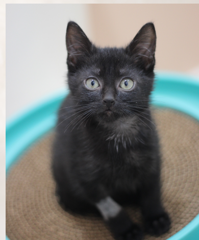
Half Pint two weeks later