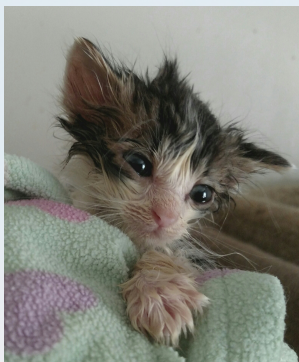
Linus was rescued from a local shelter at 3 weeks.