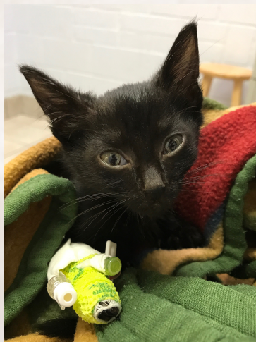
Half Pint in ER getting fluids

Five-week old Half-Pint and his siblings were pulled by CARE from a local euthanizing shelter after losing their mother. Half-Pint was so weak he could hardly stand, so he was rushed to an emergency vet for fluids and treatment. He and his littermates were overloaded with parasites and worms, which could have been fatal if left untreated. With treatment and around-the-clock foster care, he soon improved. After a week, he had doubled his weight and was running and playing with his siblings again.