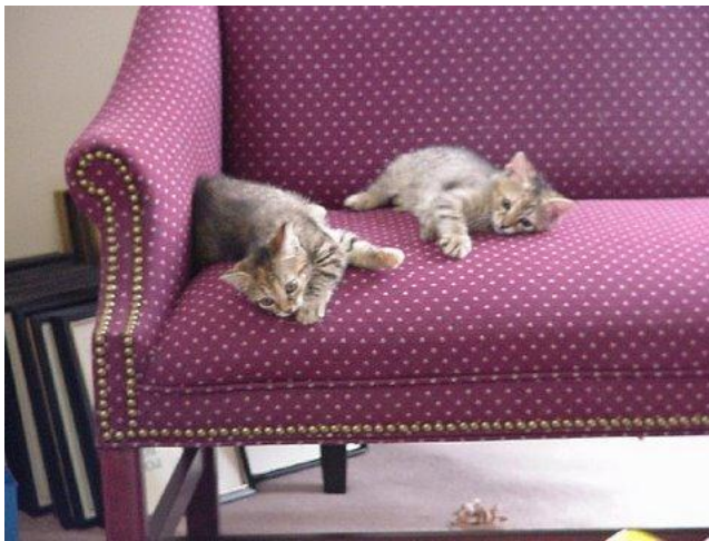
Trudy and Nadia nap after a busy morning of play

No one is sure why cats sleep as much as they do but many theorize diet plays a role. Unlike large herbivores who must graze for hours to supply their bodies with enough food, the cat's protein-rich diet does not require such an investment of time, and allows him plenty of time for napping.