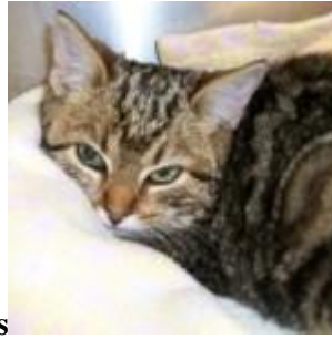
Nosey Rosey and Tigress