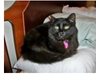
Satin in her foster mom's bed