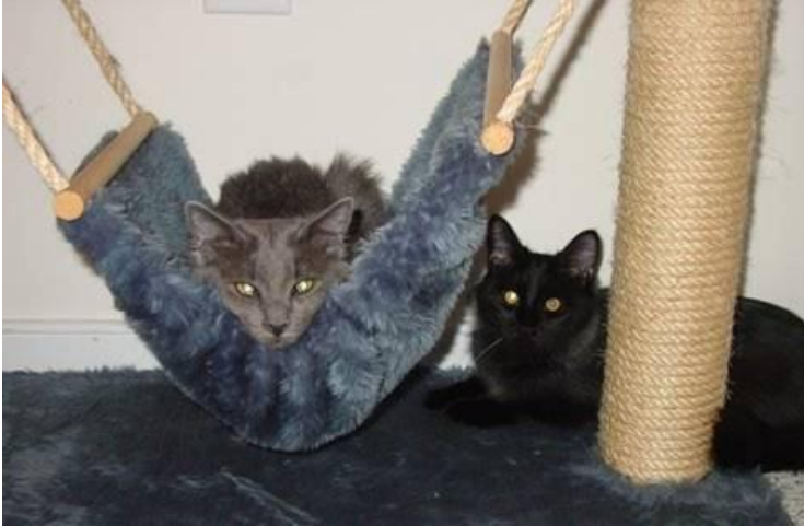
Samantha and Sabrina catch some

Who does it better? Only bats, opossum, and the notoriously slow-footed sloth, all of which sleep 80 percent of their lives, catch more shut-eye. Although the number of hours a cat spends sleeping can vary considerably among individuals, most spend an average of 16 hours per day in slumberland.