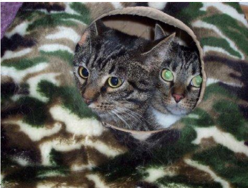
Kittens napping with a hot water