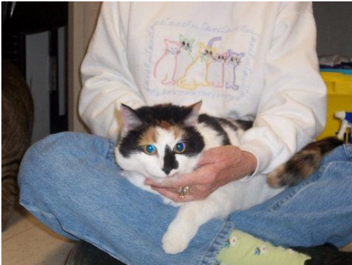
Callie napping with a

No one is sure why cats sleep as much as they do but many theorize diet plays a role. Unlike large herbivores who must graze for hours to supply their bodies with enough food, the cat's protein-rich diet does not require such an investment of time, and allows him plenty of time for napping.