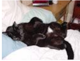
Black Cat resting well