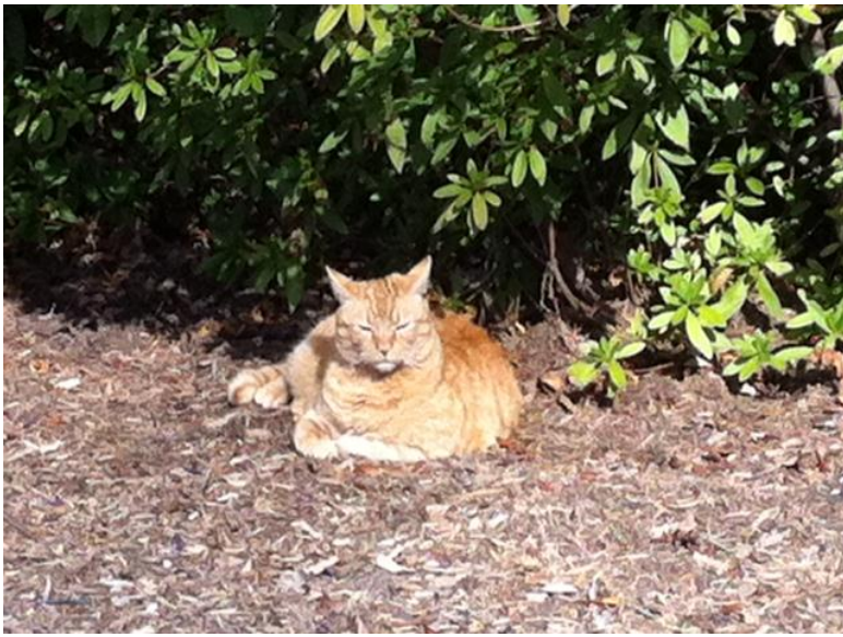
Former CARE cat Joseph, a happy barn cat now living in Montpelier, Va.