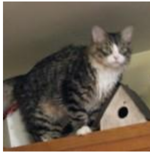
Sunny and Stormy

We are 1 ½ year old domestic long haired brothers named Sunny and Stormy because of our colors. We love to play together and chase each other around the house. Sunny loves to lie in the sunshine, Stormy loves to nap in his favorite basket. Sunny is shy and will hide around strangers but Stormy usually comes around seeking attention.